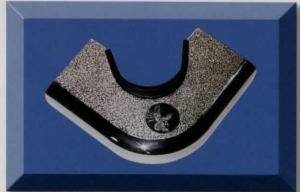
Stylish die cast reinforced, polished chrome-plated corners with Eagle logo, feature advanced screw in pocket liners for ease in replacement.