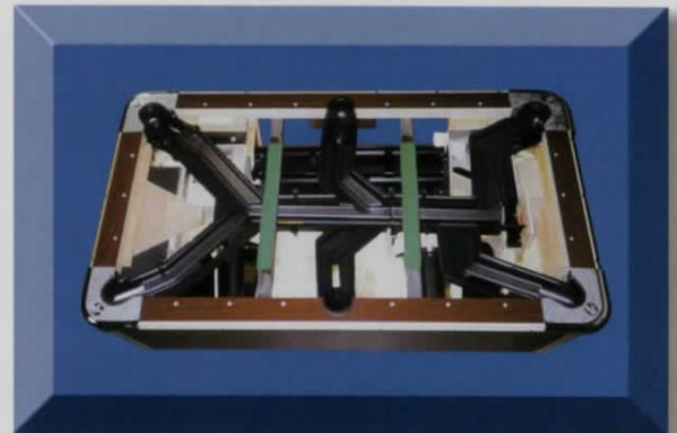
"We know you appreciate Quality" All of the features that we have previously mentioned and more that we take for granted exclusively with Great American!